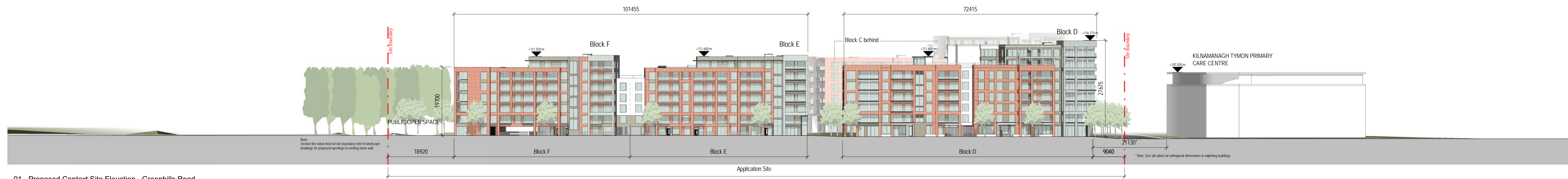
01 - Proposed Context Site Elevation - Greenhills Road 1:500