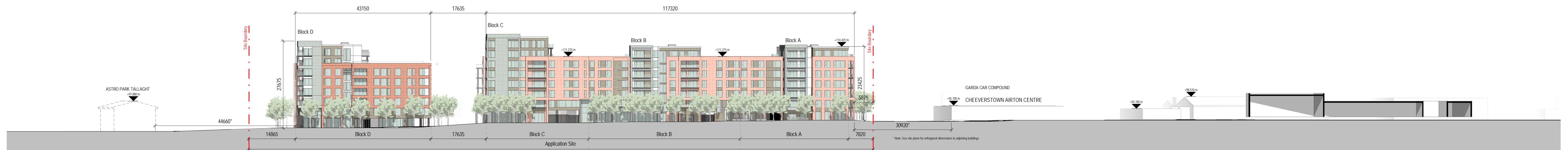
02 - Proposed Context Site Elevation - Airtown Road 1:500